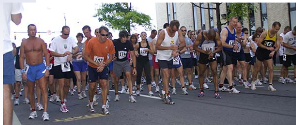
Runners, walkers, and our furry friends at last year's event.